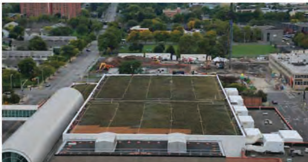
Through a partnership with Syracuse University, the performance of the green roof atop the Nicholas J. Pirro Convention Center will be measured via real-time monitoring and data collection.

Most significantly, the county upgraded the Metro plant, building new facilities that provide treatment for up to