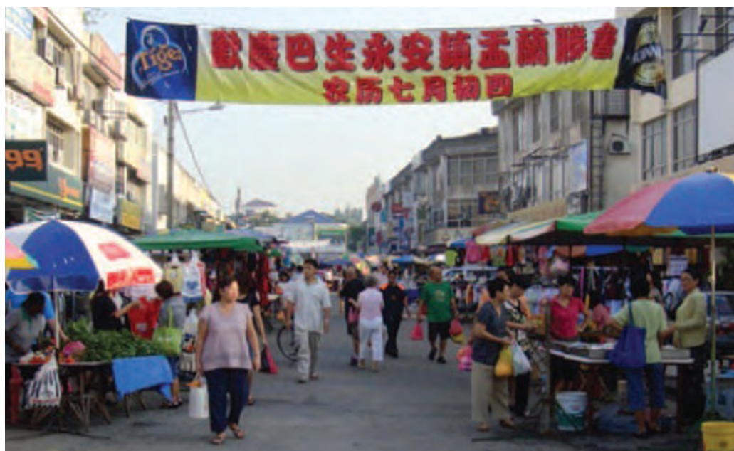
Malaysian market streets pose a challenge for stormwater control management.

Malaysia's Department of Irrigation and Drainage has recognized for decades that the rapid urbanization that accompanies strong economic growth can exacerbate water pollution problems.