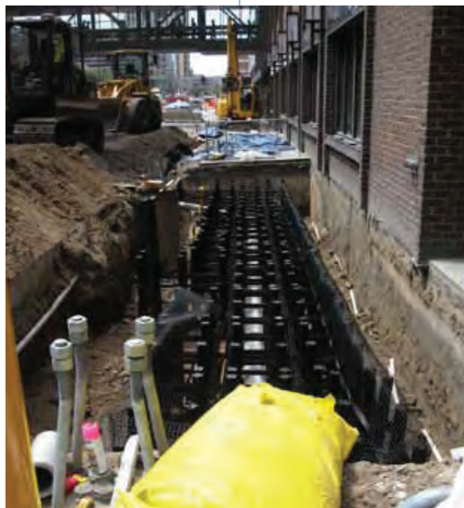
A project in Minneapolis used a suspended pavement system to support loading on sidewalks while keeping soil loose for tree growth. Kestrel Design Group

One of the keys to large, long-lived trees is adequate