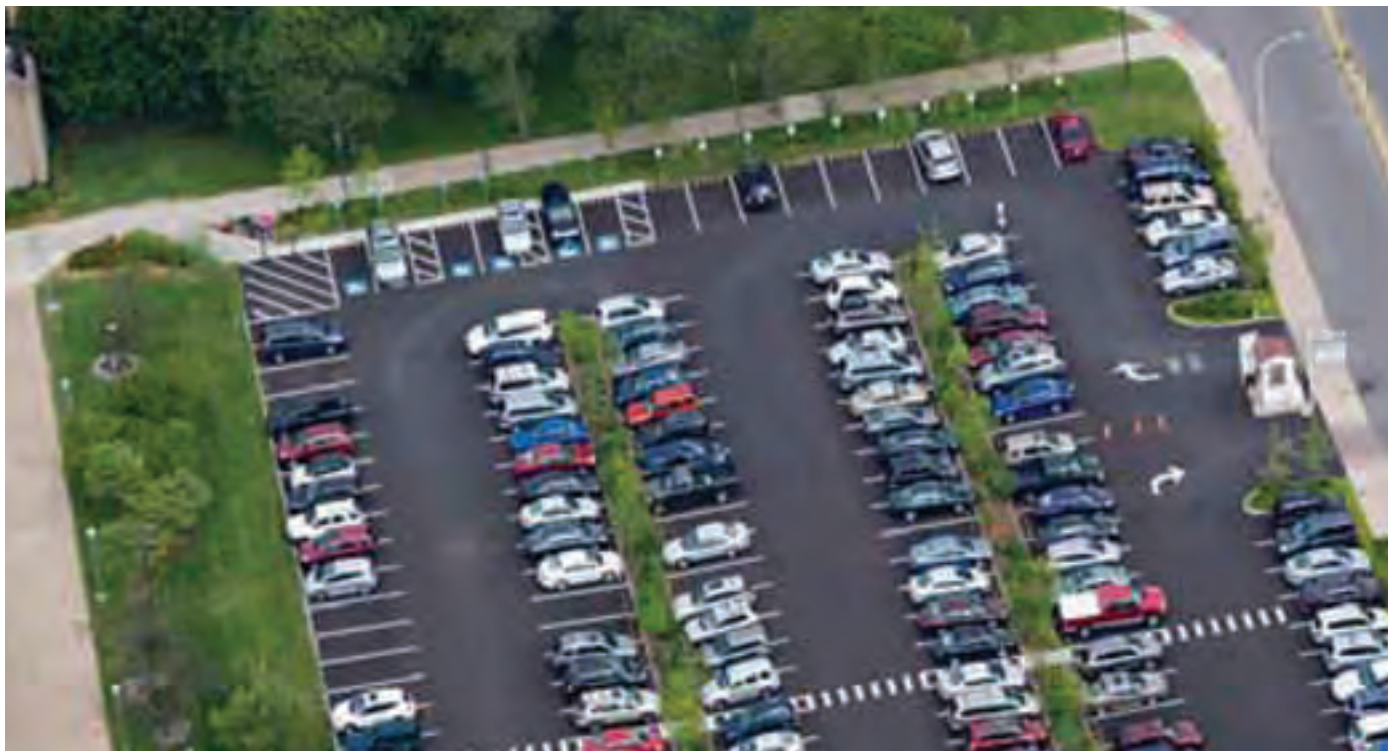
This porous concrete parking surface is one of many parking lots that were retrofitted with green infrastructure.

908,000 m 3 /d (240 million gal/d) of sanitary and wet weather flow. The plant features the largest biological aerated filter process in the United States and the first large-scale ballasted flocculation process for phosphorus removal in the Northeast. The total cost of these improvements was about $175 million.