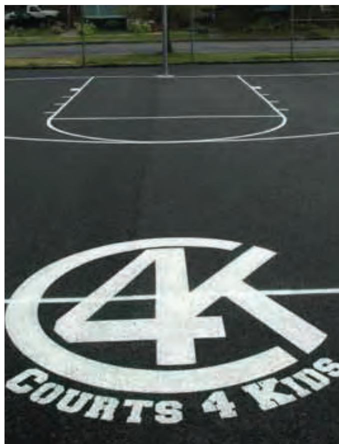
This porous basketball court minimizes stormwater runoff.